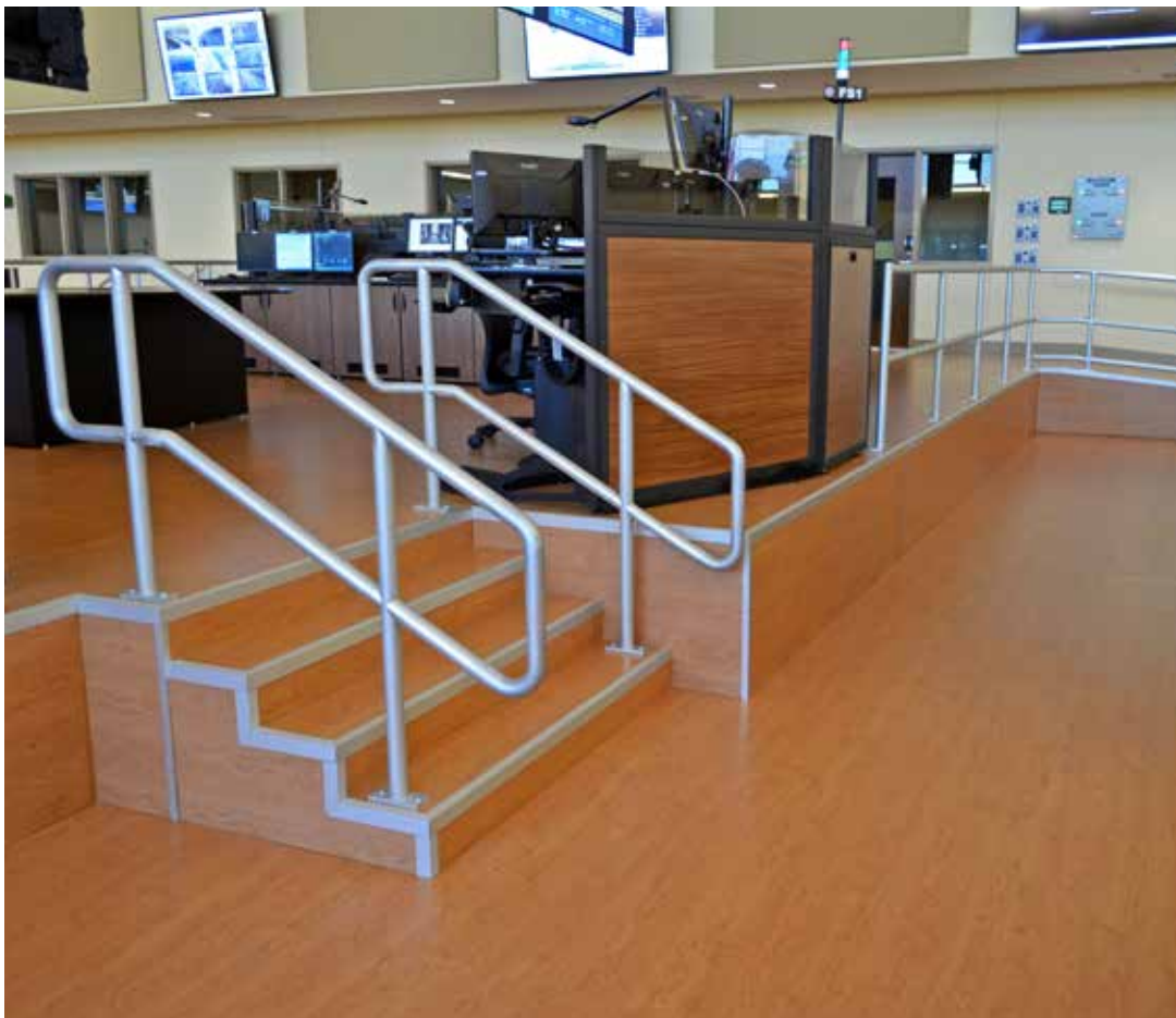
Floor panels, steps, border fascias, and ramps at Harford County Emergency Communications Center are made from the matching A0040 Oak finish.