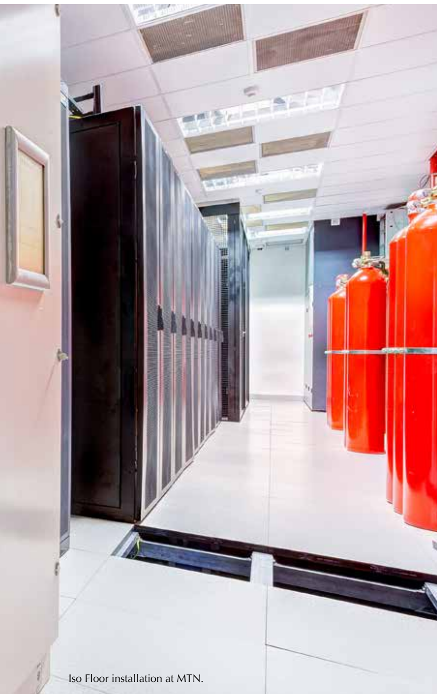
Iso Floor installation at MTN.

” The Iso Floor system provides many added values for us, including maximum flexibility, stability and strength. By using the Bergvik floor we don't need separate equipment stands for heavy CRAC's, UPS's etc.